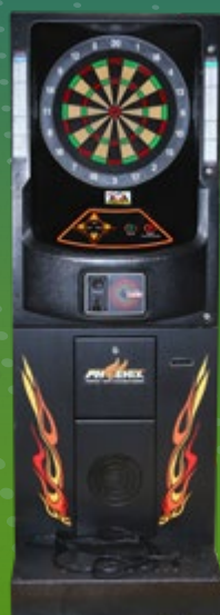
Dart Game Board